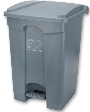
Model No. JN512