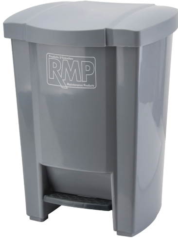
Model No. JN511